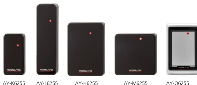
Figure 1: AY-x6255