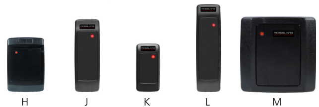
Figure 1: AY-xR12B Series

The AY-xR12B Series Proximity Readers (models AY-HR12B/JR12B/KR12B/LR12B/MR12B) are RFID proximity card readers to be installed for use with access control systems.