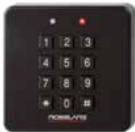
UK Gang Box CSN SELECT™ Convertible Reader with Keypad