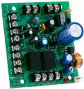
Secured Power Supply Unit – PCB Module