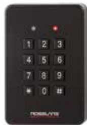
US Gang Box CSN SELECT™ Convertible Reader with Keypad