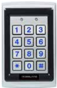
Convertible Anti-Vandal US Single Gang Backlit goPROX® & PIN Reader