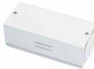
Intelligent Secured Power Supply Type A Box