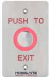
Analog Piezoelectric REX Switch with Toggle Option