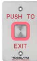
Digital Piezoelectric REX Switch with Toggle Option