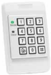
Indoor PIN / Proximity & PIN Standalone Controller