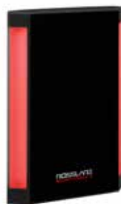
Illuminated CSN SELECT™ Smart Card Reader