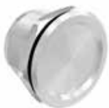
Small Metallic Piezoelectric Push Button