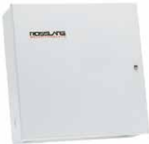
Intelligent Dual-Relay Secured Power Supply Type C Box(PS-C25T), US Version (PS-C25TU), C Box without Transformer (PS-C25LT)