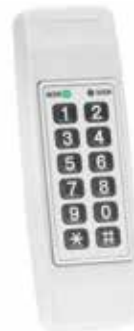
Indoor Mullion PIN / Proximity & PIN Standalone Controller