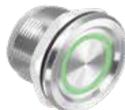
Small Metallic Piezoelectric Push Button with Ring LED