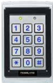
Anti-Vandal MIFARE® Contactless Smart Card Sector Reader with Keypad