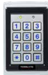
Anti-Vandal US Single Gang CSN SELECT™ Convertible Reader with Keypad