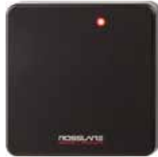
UK Gang Box CSN SELECT™ Reader