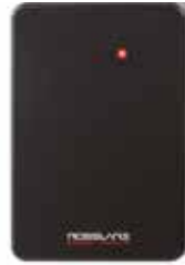
US Gang Box CSN SELECT™ Reader