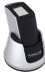
USB Fingerprint Scanner