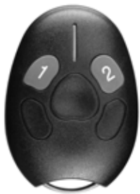
2-Channel Transmitter for AY-L23 Receiver