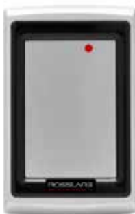
Anti-Vandal US Single Gang CSN SELECT™ Reader