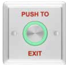
Plastic Slim Piezoelectric REX Switch with Light Ring