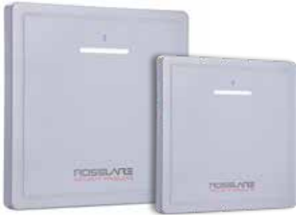
Long-Range UHF-RFID Reader with Bluetooth BLE-ID