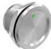
Small Metallic Piezoelectric Push Button with Spot LED