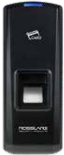
Fingerprint & Card Reader for indoor use