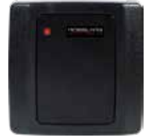
UK Gang Box Sized Proximity Reader