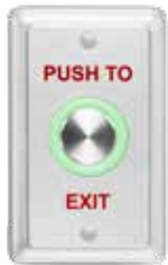
Plastic Slim Piezoelectric REX Switch with Light Ring