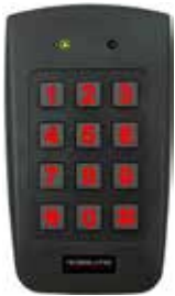
Outdoor 3x4 Backlit Proximity & PIN Standalone Controller