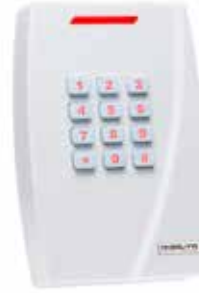
MIFARE® Contactless Smart Card Sector Reader with Keypad