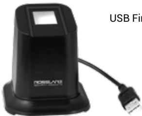
USB Fingerprint Scanner