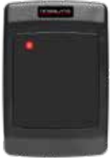
US Gang Box Sized Proximity Reader