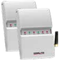
Wireless Access Control Door Interface Near Unit / Far Unit