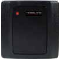
UK Gang Box Sized MIFARE® Contactless Smart Card Sector Reader