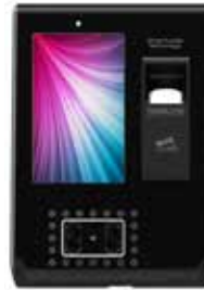
Face & Fingerprint Recognition Reader with dual RFID Card Reader & PIN Code