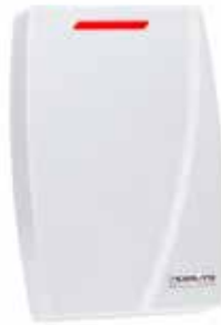
MIFARE® Contactless Smart Card Sector Reader