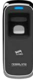
Anti-Vandal Fingerprint & Card Reader for outdoor use