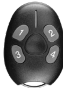
4-Channel Transmitter for AY-L23 Receiver