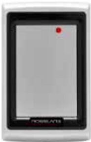
Anti-Vandal MIFARE® Contactless Smart Card Sector Reader